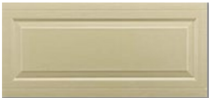
Ranch Panel Model 5270 - 5770