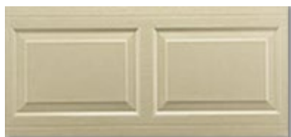
Raised Panel Model 5280 - 5780