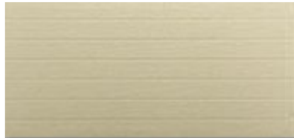
V-Groove Model 5212 - 5712