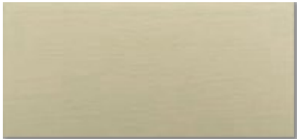
Flush Model 5210 - 5710